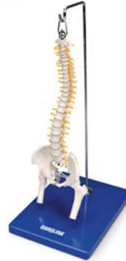
Spine with Femur Heads