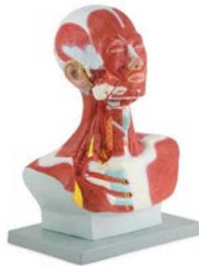
Head and Neck Musculature