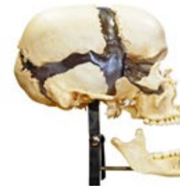
22 Part Human Skull