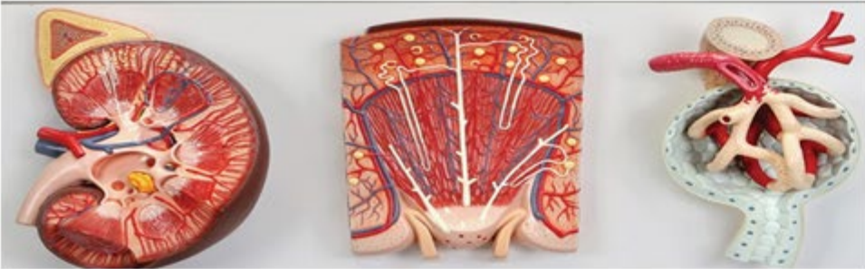
Kidney, Nephron, and Renal Corpuscle