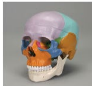
3 Part Human Skull