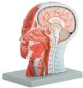
Half Human Head