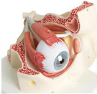
Eye in Orbit