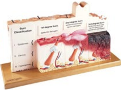
Skin with Burn Pathologies